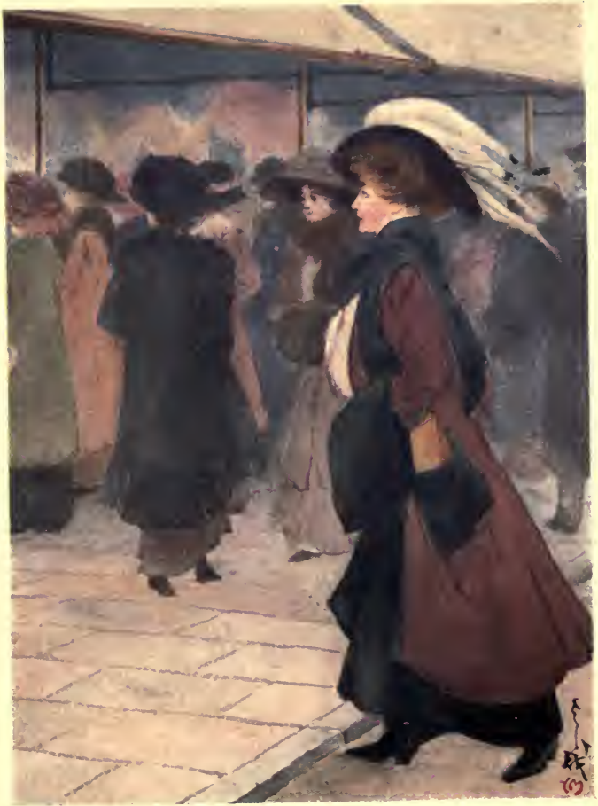
WALKING IN THE STREET.